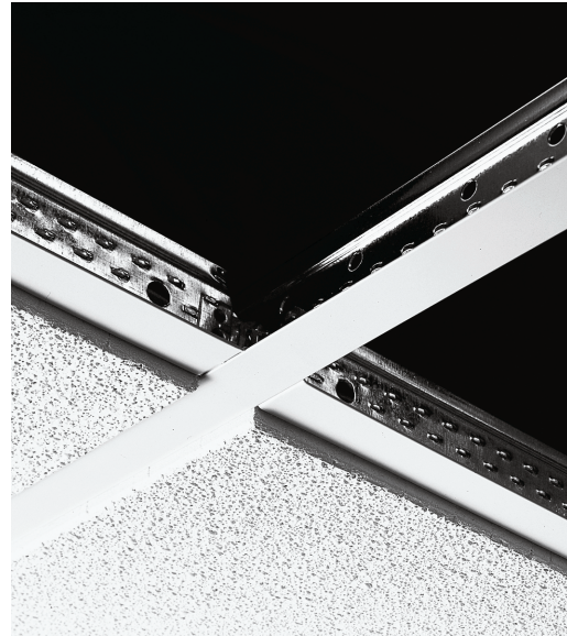
Prelude XL suspension system

SUSTAIN™ High Performance Sustainable Ceiling Systems